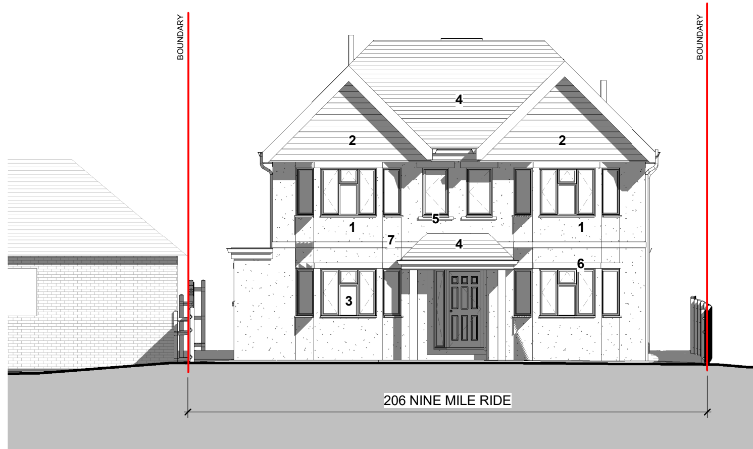
FRONT ELEVATION - NORTH